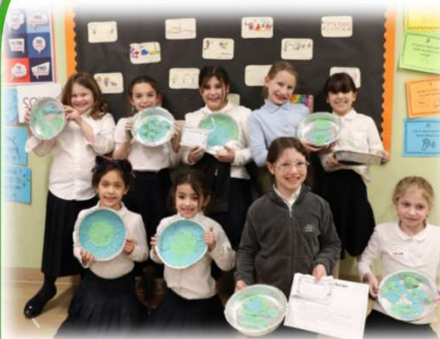
2 nd grade learned about different landforms and then created their own out of clay.