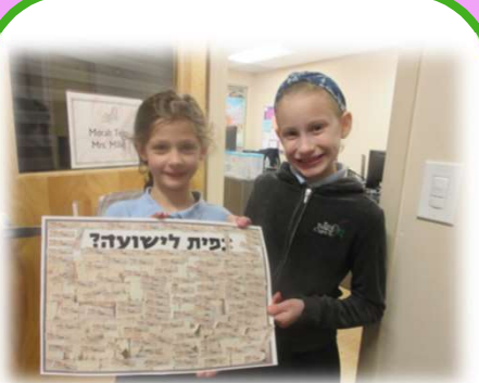
'ב' completed their צפית לישועה chart and earned a new charm for their bracelets.