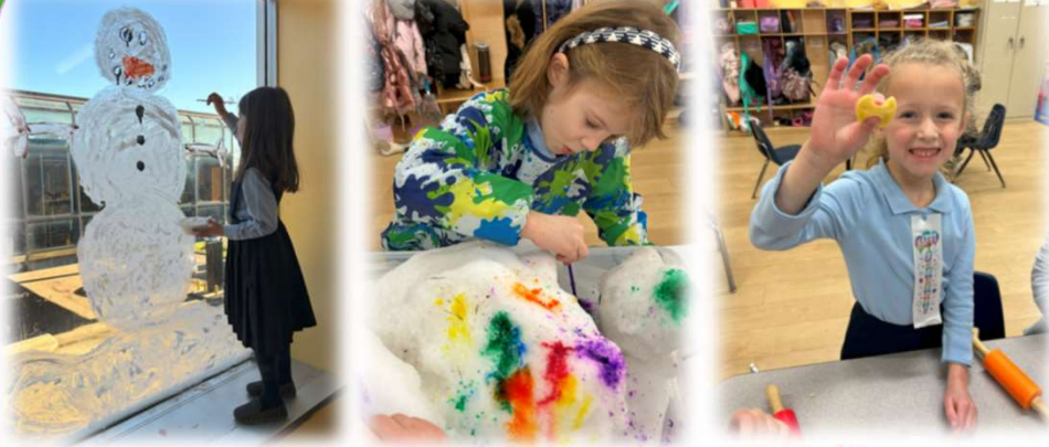
Painting a snowy scene on the window, coloring snow, making pasta from scratch; all in a day's fun in Pre 1A.