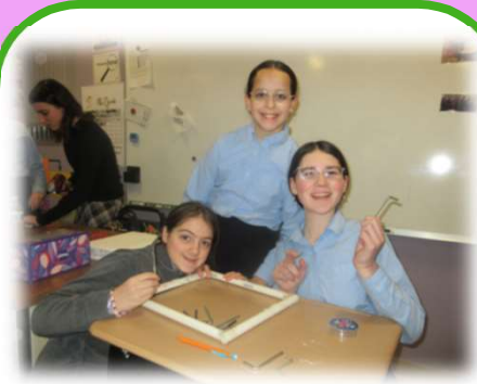
6 th graders are producing homemade musical instruments after learning about the principles of sound.