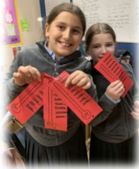
3 rd graders are learning how to use impressive vocabulary in their paragraph writing.