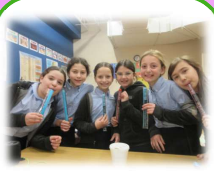
ספר בראשית חידון א סטת כתה ה'.