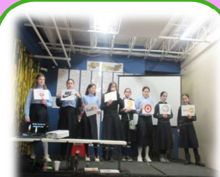
The assembly נועם שבת highlighted the mitzvah of הדלקת נרות.