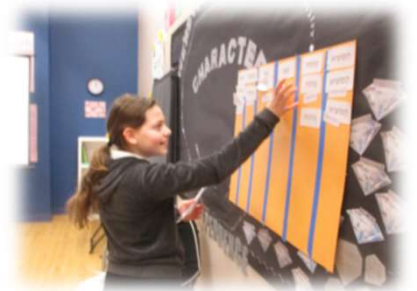
ברכות הלכות programs were introduced in כתות ב-ה with a Spot It ברכות game.