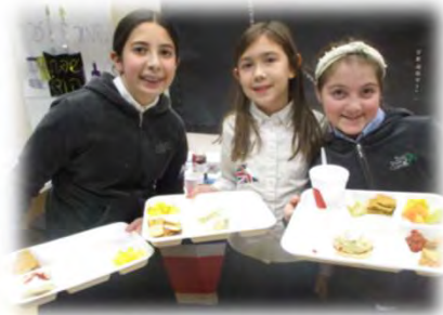
We wrapped up a general knowledge program in grades 4-6 with a Tourism Day Taste a Thon.