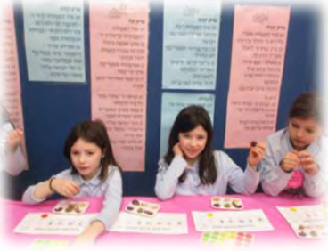
Our תלמידות experienced a taste of the שבועת המינים on ט"ו בשבט.