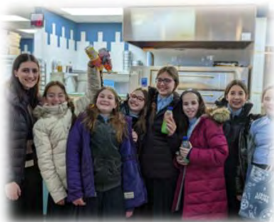
Celebrating great accomplishments in 6 th grade with a brunch and bowling bash.