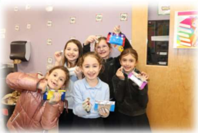
2nd grade started learning about dollars and cents! They created their own duct tape coin purses to keep the coins that they earn.