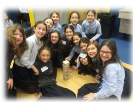
Assemblies גדולה באמת. Games of jenga and chutes and ladders all reinforced the lesson of שקר אין לו רגלים.