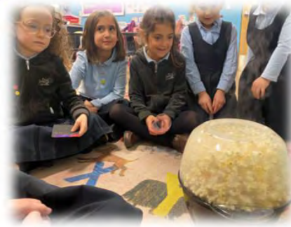
Pre 1A תלמידות popped popcorn to reinforce the האדמה of הברכה.