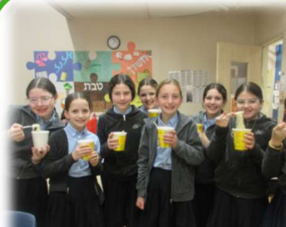
ה'תה כתה enjoyed a chicken soup lunch in honor of completing a class שבת program.