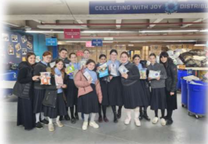
ו' visited Yad Leah, as part of their Bas Mitzvah program.