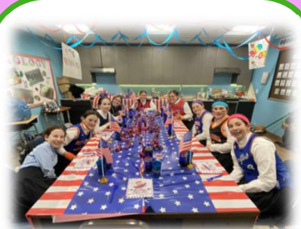
7 th grade culminated their unit on the Constitution with a July 4 th party.