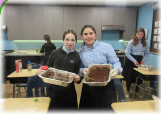
7 th grade baked delicious brownies for BYC תלמידות to enjoy as part of our נועם שבת program.