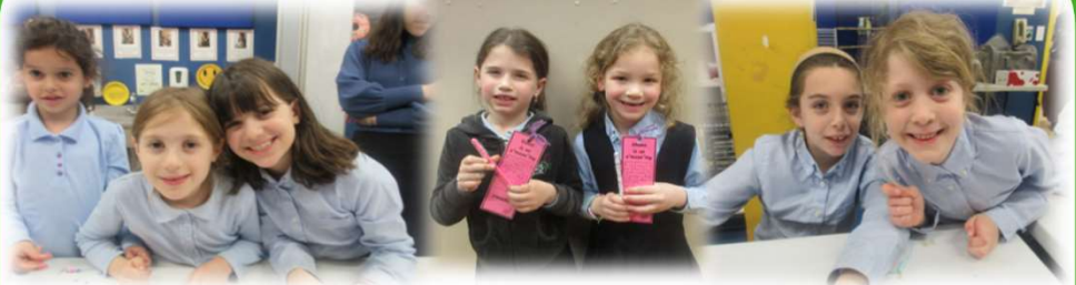
We finished our reading budding program with an "amaze"ing finale assembly! Everyone made their buddy a bracelet and received a bookmark and maze pen.