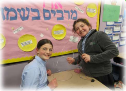
6 th grade made Wacky Wire games in their STEM class.