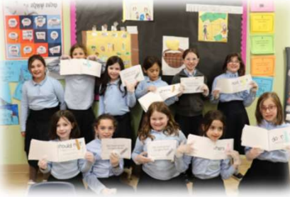
Our 2 nd grade doctors did contraction "surgery" on two words, fixing them up to be one with an apostrophe "bandaid"!