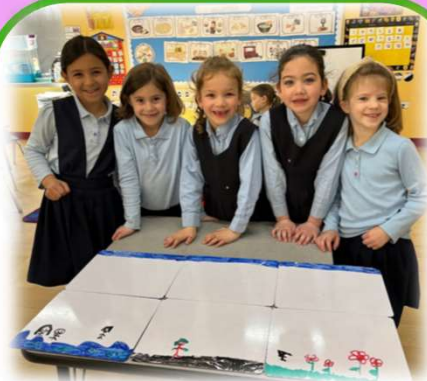
Pre 1A working in unison to create a beautiful picture.