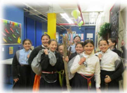
'ח' marched around the building with sticks in their hands chanting as they re-enacted יציאת מצרים.