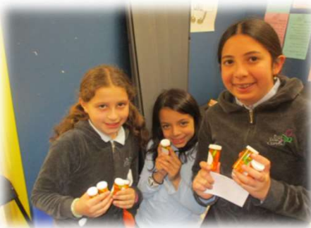
Erev Shabbos גדולה בדיבור assembly. Reminder, don't forget to take your שמירת הלשון pills.