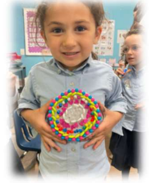
Pre 1A enjoyed a sensory push pin activity at centers.