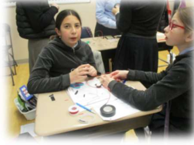
6 th graders created circuits in their STEM class.