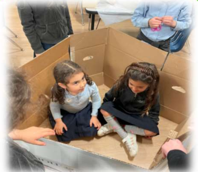
As a follow up activity to the book, "What to do with a Box," pre 1a created a clubhouse out of boxes.