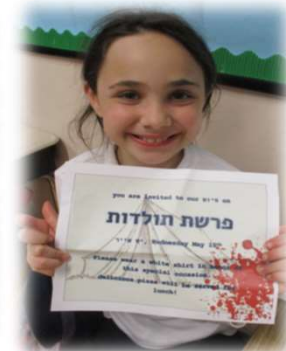
מזל טוב ג' כתיבת סיום פרשת תולדות