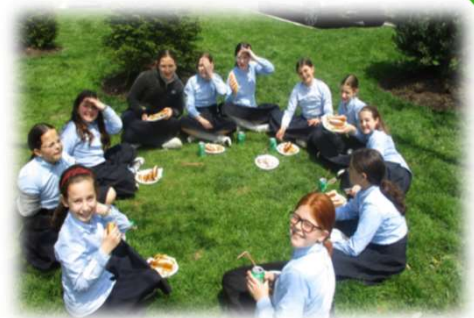
Enjoying the gorgeous weather while eating a bbq lunch on Lag B'omer.