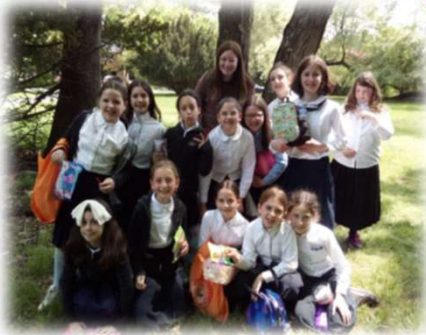
Mazel tov ד' סיום כיתה ד' פרשת וישב.