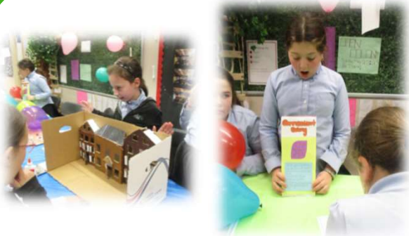
5 th graders displayed their colony dioramas. All students voted on which colony they would purchase.