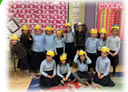
'מאורות כיתה א' wearing their crowns.