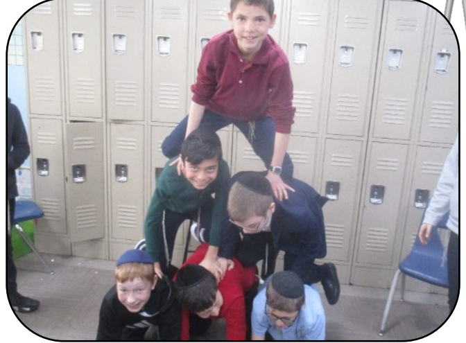
6th grade pyramid, enacting a case from פרק אלו מציאות