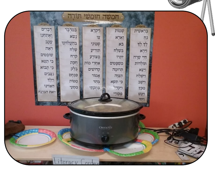
Lentil cholent in Pre1a!