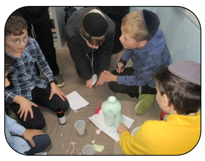
Explosive Science fun in 5th!