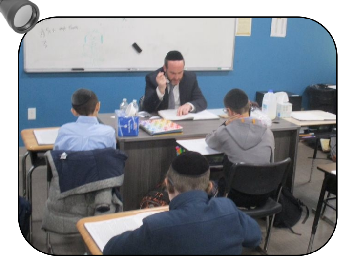
Maseches Makkos Hasmada in 7th!