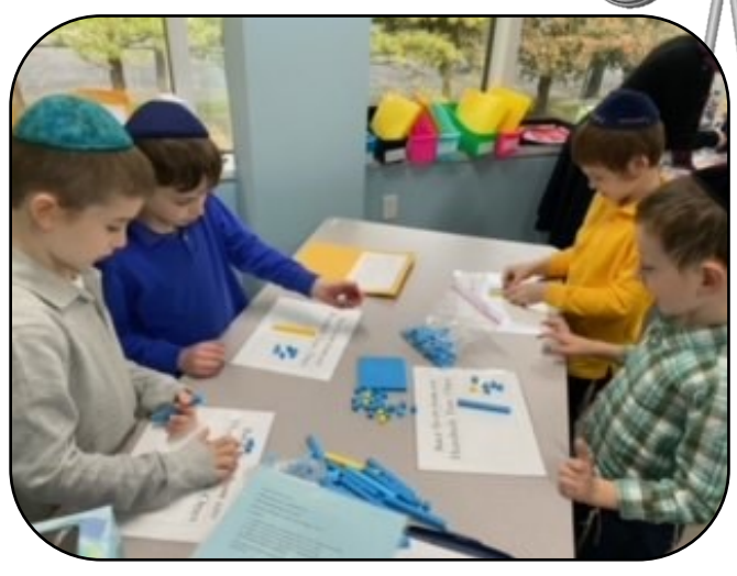
Seriously engaged in 2nd Grade Math Lab!