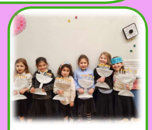
1st grade practiced building sticky sound words while assembling beautiful menorah creations.