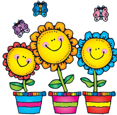
Celebrating our special "os!"