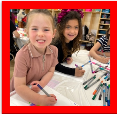
Writing and coloring