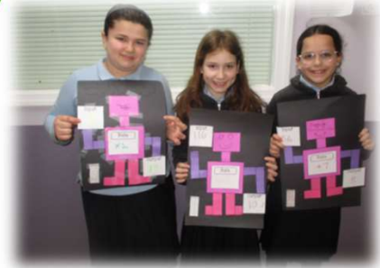
4 th grade math function robots, displaying input and output.