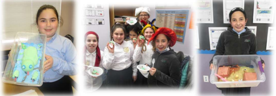
Real life, action-packed מכות lessons in 'ה' כיתה.