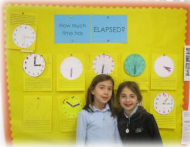
3 rd grade created their own time lapse problems.