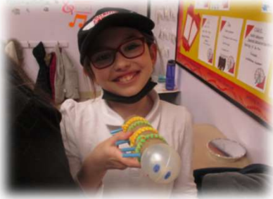
5 th grade is applying their knowledge of balanced and unbalanced forces while crafting jitterbugs.