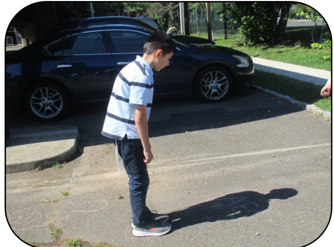
4th Grade learned about the earth's rotation and how that impacts our day!