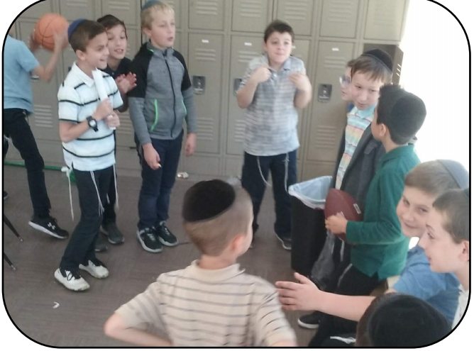
A group recess planning discussion with 4th & 5th!