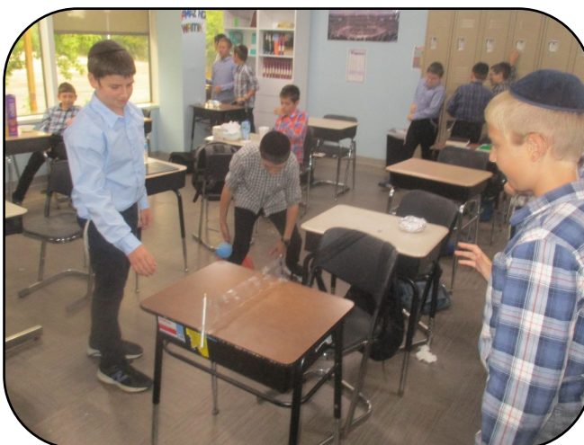
Desktop tennis in 7th!