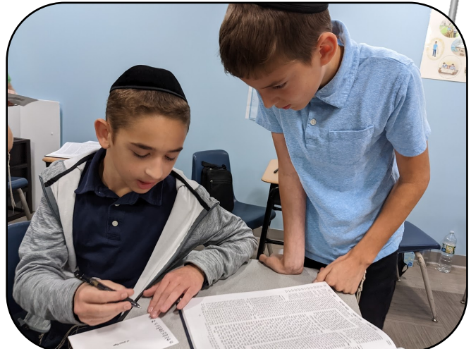
Shteiging in 6th!