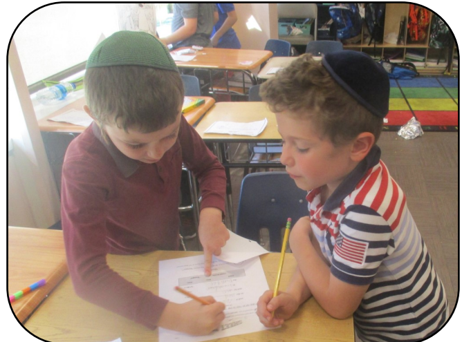
Chumash worksheets in בחורות