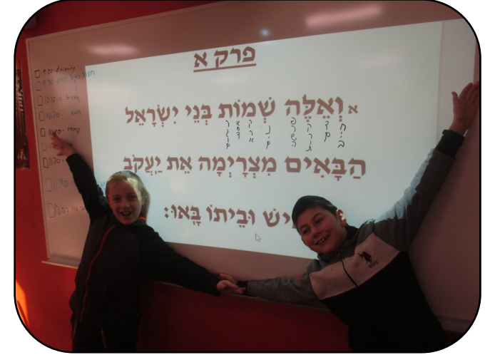
4th grade celebrating their joining the Shnayim Mikra program with a ראשי תיבות in their vey own פרשת שמות