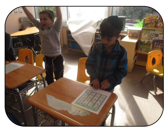
ישורשים enjoyed a fun bingo game to review their שורשים!