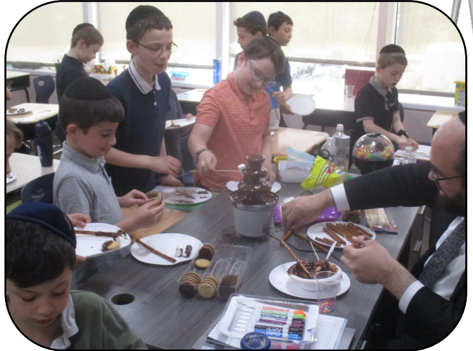
Chocolate fountain siyum in 3rd!