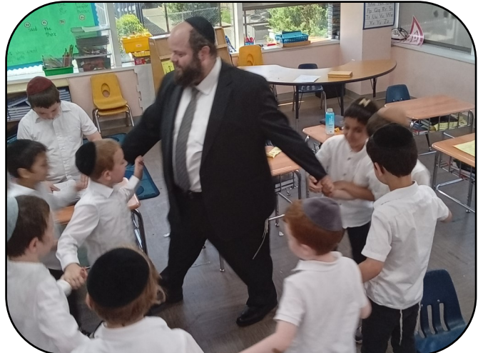
סיום פרשת בראשית on your כה א Mazal tov