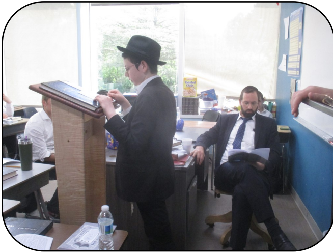
Another 8th Grader delivered a mishnayos shiur!