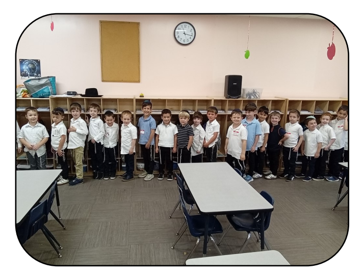
Pre1A practicing lineup procedures!