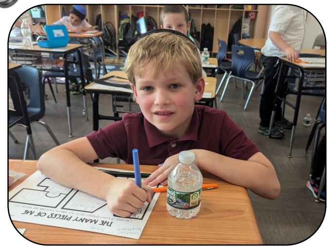
Writing about ourselves in 2nd!