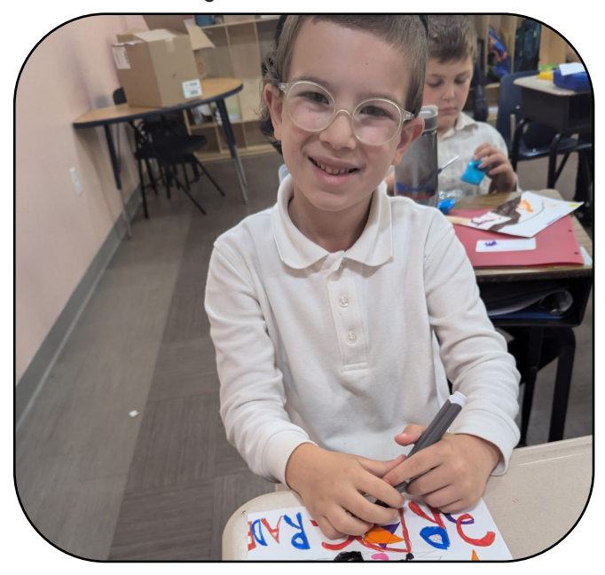
Class flag decorating in 3rd!