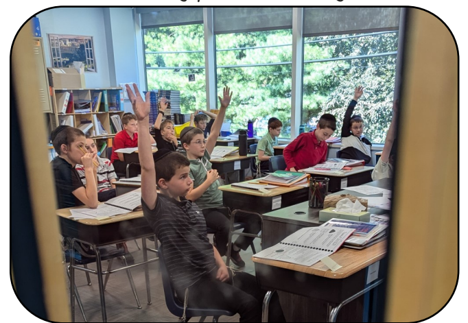
5th at work!