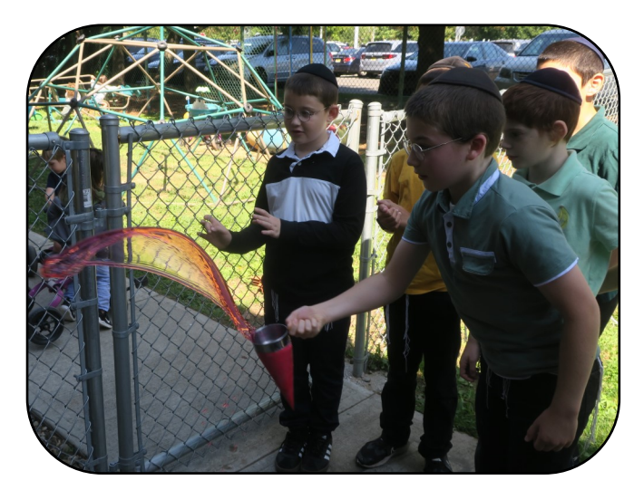
5th Grade performing זריקת הדם!