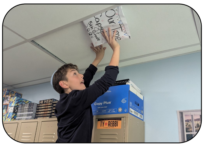
Burying a time capsule!