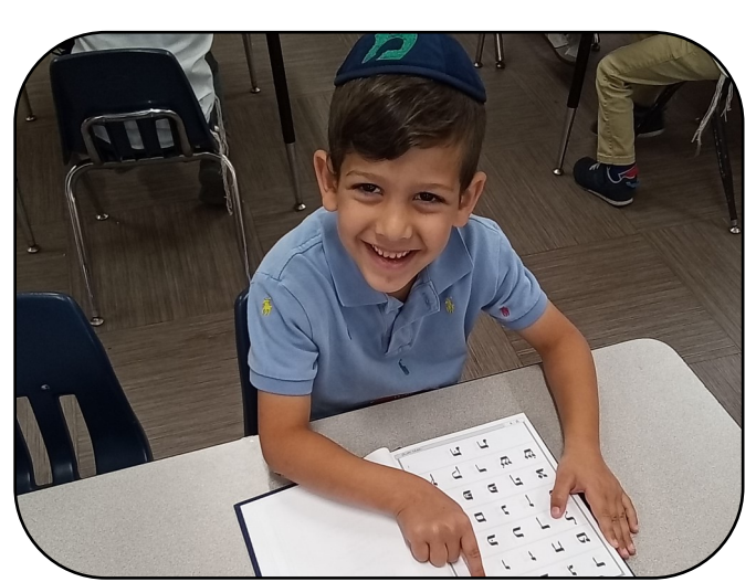
Pre1A practicing Kriah procedures!