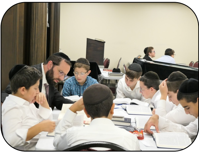
8th Grade Chumash Chavrusas & Chabura