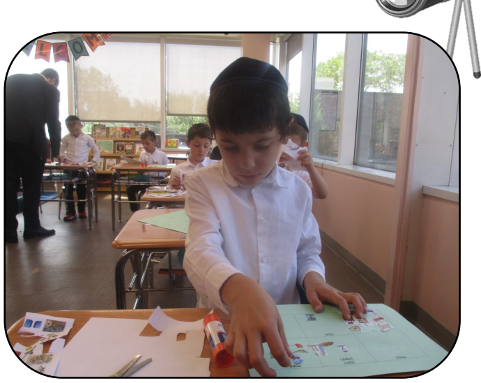
Hard at work on a project in 1st grade!